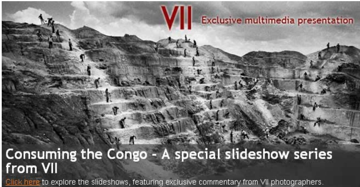
Consuming the Congo , multimedia presentation, Enough Project and VII, November 2009