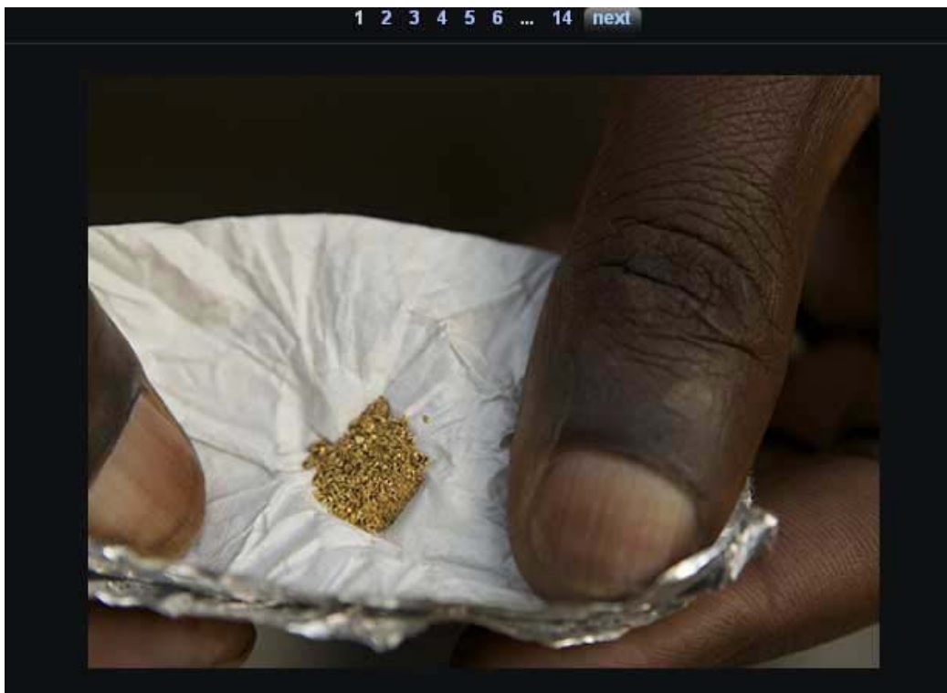
Congo's Conflict Gold, CBS News.com, November 2009