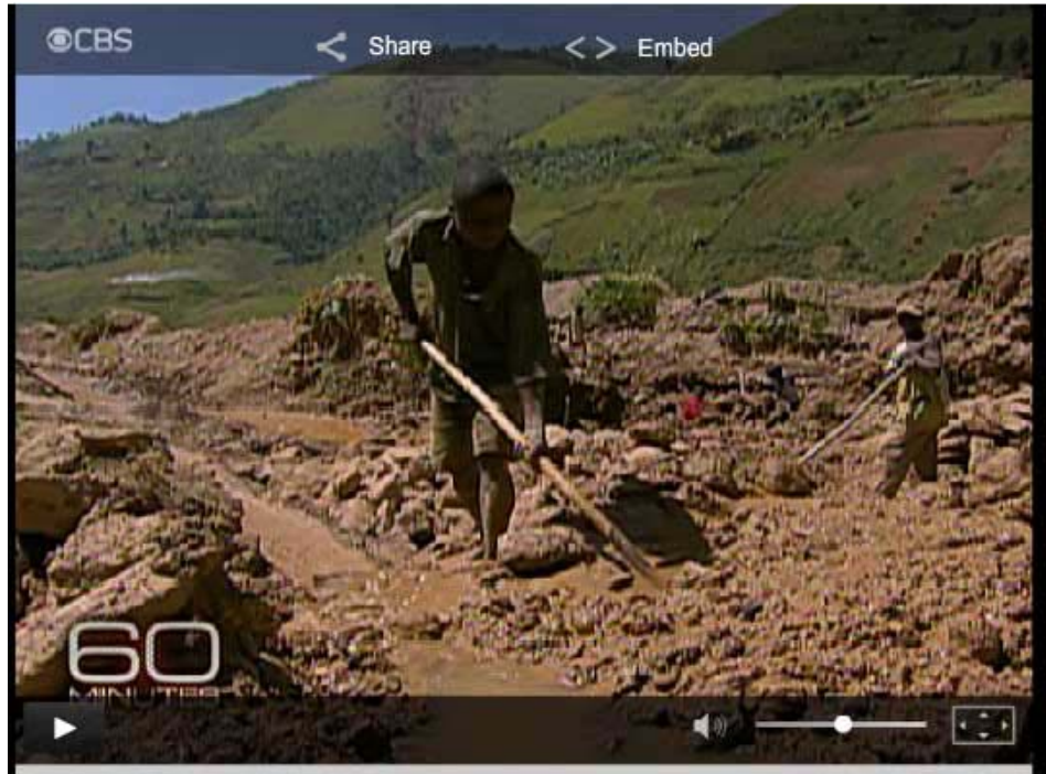
Congo's Gold , CBS 60 Minutes, November 19, 2009