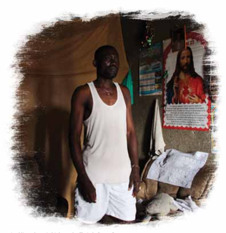
A soldier at home in his barracks, Katindo Camp. Goma

for the FARDC, and conducting administrative training. The census started in 2006, and has been able to offer a far more reliable idea of numbers of serving soldiers than was previously available<sup>83</sup>. The strategic purpose of interventions matters more than their cost.