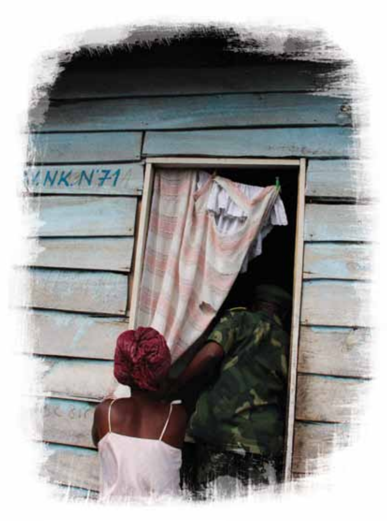
Officers' Quarters at Camp Katindo in Goma, North Kivu province. Originally intended to house 150 people, the camp is now home to more than 16,000 people including many soldiers' families.

6. Yet despite this consensus, military reform efforts have failed, both during the transition and afterwards. They have failed for two primary reasons. The first is the lack of political will on the part of the Congolese government; the second inadequate and poorly coordinated assistance from the donor community.