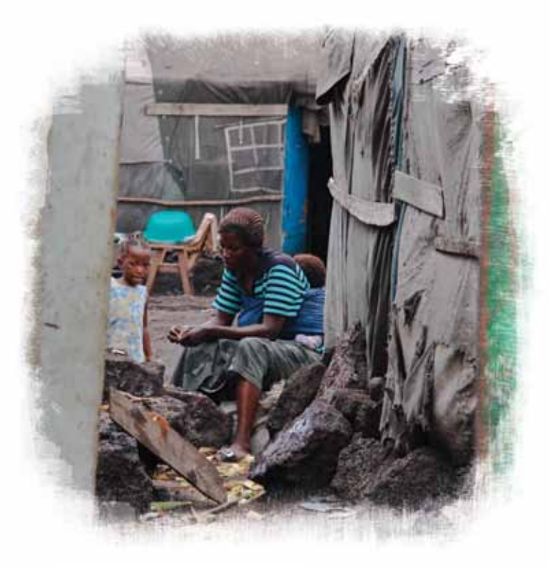
A military family living in Camp Katindo, North Kivu, Most families in the sprawling army camp live in tents or makeshift structure

24. Regional organizations, most importantly the African Union (AU) and the Southern Africa Development Committee (SADC) have a pressing and legitimate interest in regional prosperity and stability. And the international financial institutions - frequently cited as the actors with the most significant leverage and access in Kinshasa<sup>71</sup> - are committed to helping the DRC achieve sustained economic growth. The IMF is the only actor currently providing direct budget support to the DRC government<sup>72</sup>.