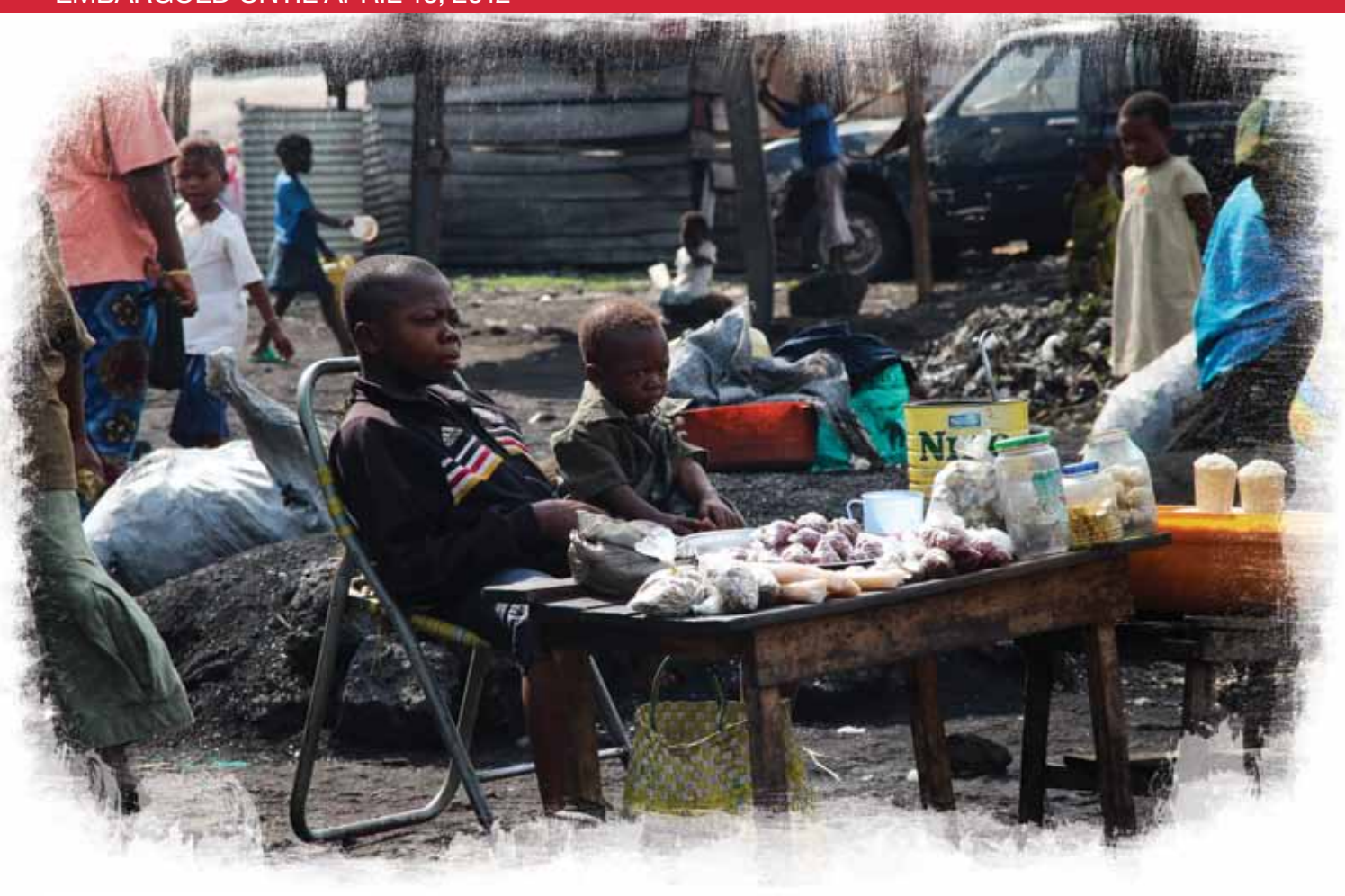
Most military families cannot afford to send their children to school. Children often work from young age to contribute to the family income