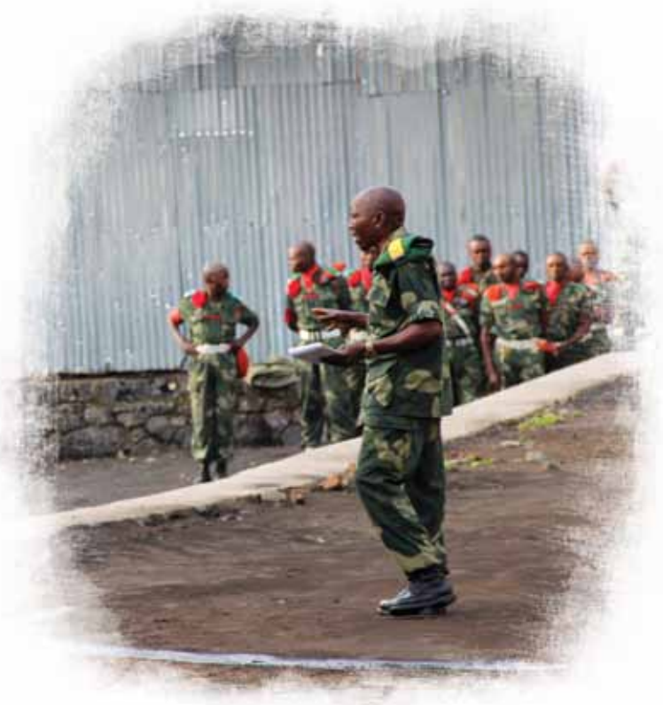
mmander inspects his troops. Formal command structures in the FARDC are routinely bypassed

15. And, far from being 'post-conflict', the DRC continued to suffer from extremely serious bouts of violence. Through the post-2006 period, successive spikes of conflict or regional tension left the international community scrambling to address acute short-term political crises or humanitarian emergencies. There were demands for immediate action against armed groups such as the CNDP, FDLR or LRA - necessitating the mass deployment of ineffective and poorly trained FARDC units<sup>55</sup>.