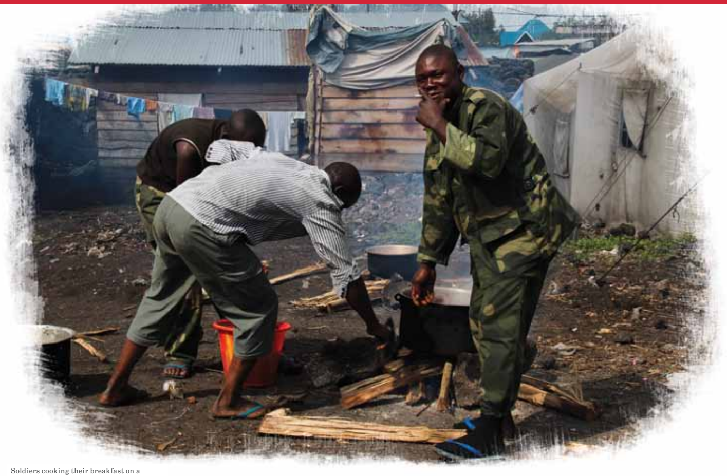
Soldiers cooking their breakfast on a campfire. Many troops are missing basic requirements like military issue boots.