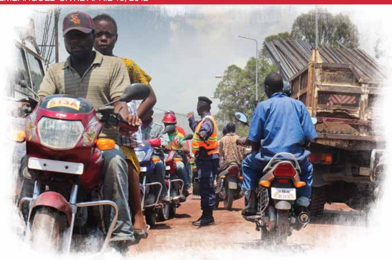
Congolese police patrol the main streets of Goma.