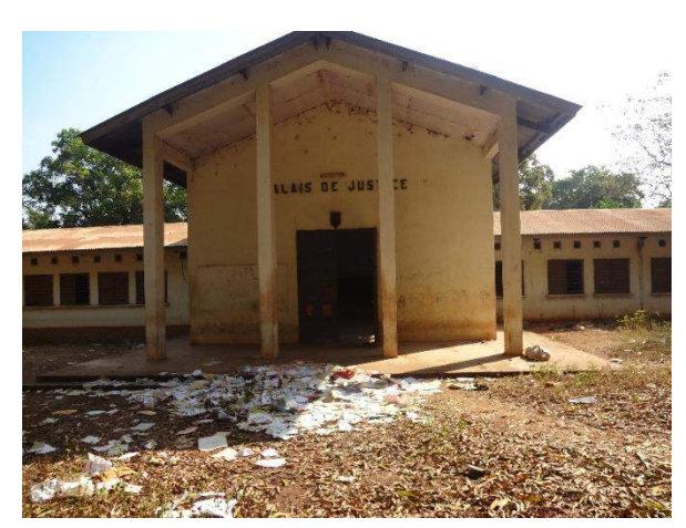
Court hall in Kaga Bandoro looted and vandalized by Séléka forces when they captured the town in December 2013. Photo credit: Kasper Agger, Kaga Bandoro, February 2015.

While the majority of the international community is seeking to fast-track elections and bring a speedy end to the transition,<sup>28</sup> the armed groups are also making efforts to strengthen their positions. These groups, which have formed alliances and rivalries and seen their influence rise and fall, have growing interests in the outcome of upcoming elections and possible power-sharing arrangements. Armed groups are using violence and kidnapping as political tools to gain influence and to remain part of the CAR political landscape.<sup>29</sup> Different Anti-Balaka groups were responsible for a string of short-term kidnappings of aid