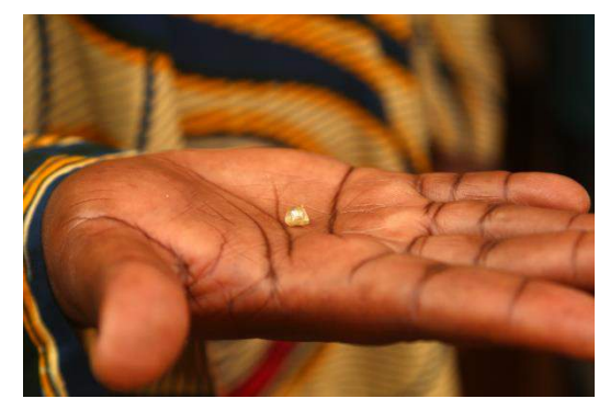
Diamond trader hold an illegal diamond sold without any official papers and collected for smuggling out of CAR. Photo credit: Toby Woodbridge, Bangui, February 2015.

The diamond patron told Enough that members of the FPRC would monitor his operations closely by conducting regular visits to his diamond site; they would arrest his miners at times and often had people posted around his area along the river to monitor the flow of people and diamonds. The patron estimated