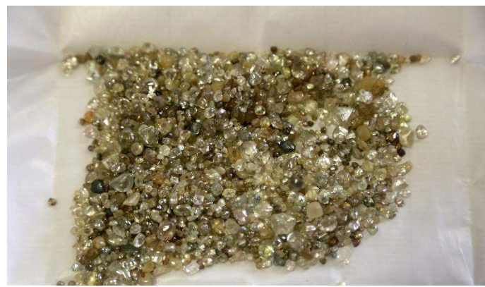
Some of the diamond stockpile held by the Central African diamond company Badica.

Whereas the FPRC profits from control of diamond areas, the UPC has taken control of gold mines in Ouaka prefecture north of Bambari, according to gold traders in the area.73 The exploitation of the Ndassima gold in particular has been documented.74 The U.N. Panel of Experts on CAR estimates that "former Séléka forces collect approximately $150,000 in taxes per year from local gold production [from the Ndassima mine], which is estimated at 180 kg per year."75 Local gold traders in Bambari interviewed by the Enough Project said that members of the UPC under the command of