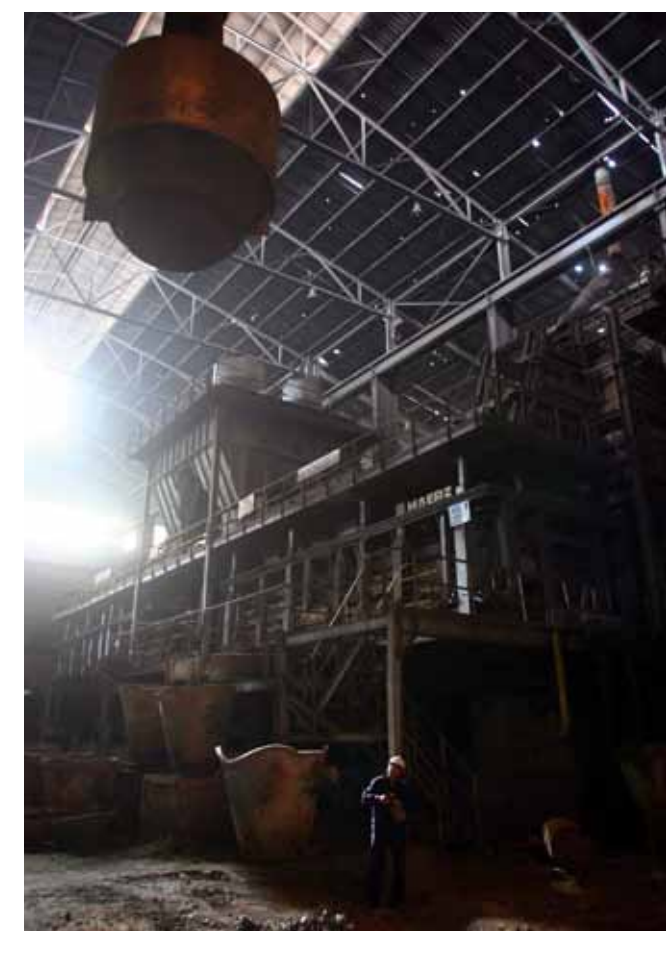
Inside a tin smelter.

ficient, but with a more robust system of independent audits that would ensure that companies are not responsible for policing themselves, this initiative could positively impact the trade.<sup>16</sup>