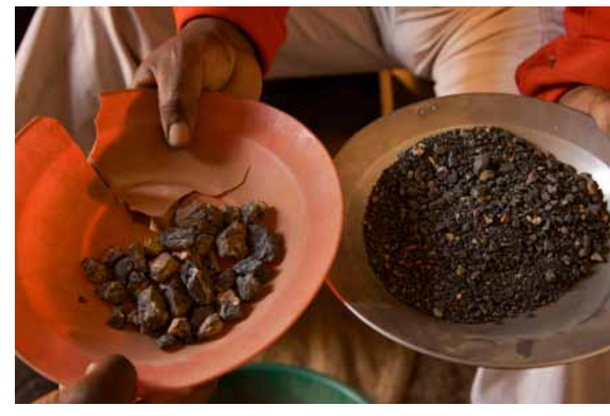
A minerals dealer compares tin ore from a rebelheld mine and a government-controlled mine.

Contrary to what some companies allege, we found that it is fairly straightforward to tell from where the minerals originate, as both dealers at the buying houses and government mining inspectors demonstrated to us. Each sack of minerals had different coloration and texture, depending on which mine it came from.