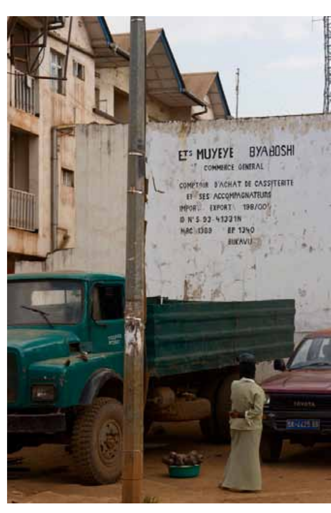
An exporter cited by UN experts as purchasing minerals from the FDLR.

There are also massive concerns with the gold trade. According to Congolese government sources, in 2008 Congo legally exported only 270 pounds of gold, compared with an estimated 11 thousand pounds of production. This means that the lion's share of the profits for the gold trade accrues to the armed groups, further fueling the cycle of violence in Congo.