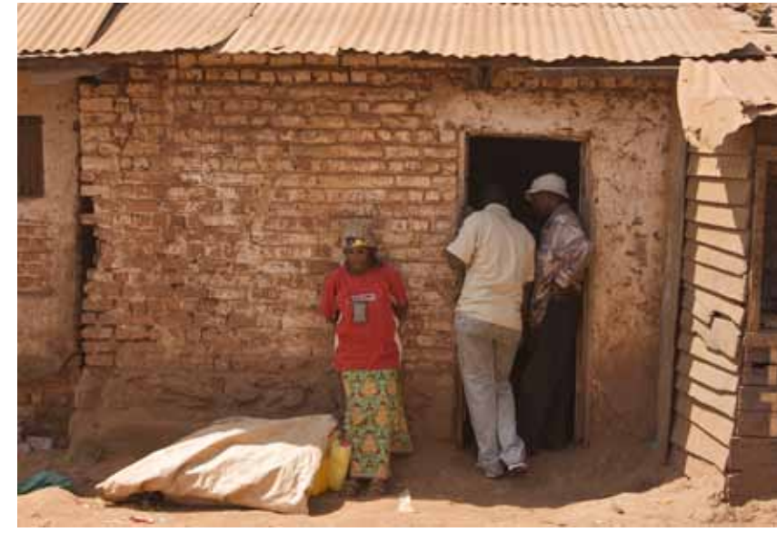
Mineral trading house in Bukavu, South Kivu.

gold can easily be concealed in a backpack or pocket. As a result, it is very easy to smuggle gold.